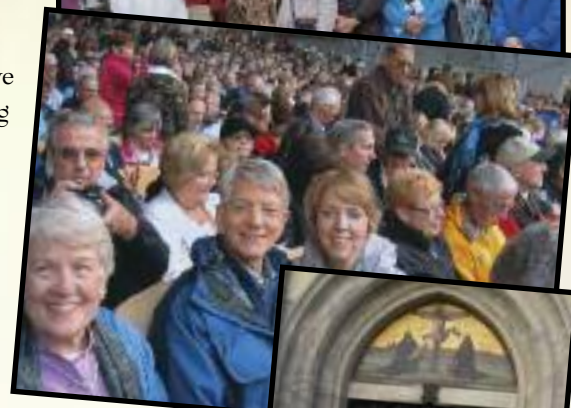
Great seats at the Passion Play!